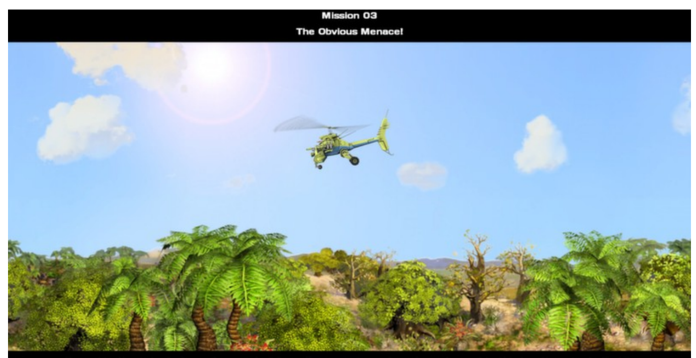
Your objective is to destroy all enemy buildings. 6 weapon boxes have been dropped to this location - try to find it.